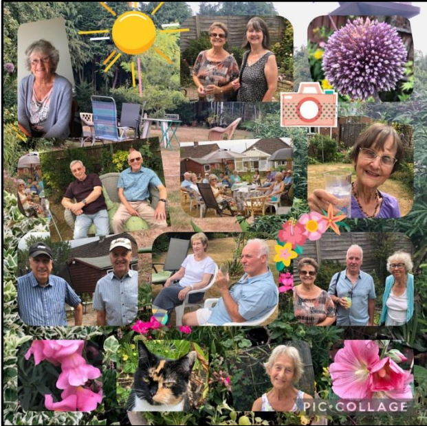
Afternoon tea in a member's garden, getting to know each other.