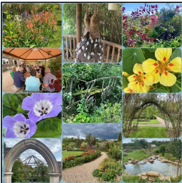
A beautiful day out at the New Forest Lavender Gardens and tea rooms....