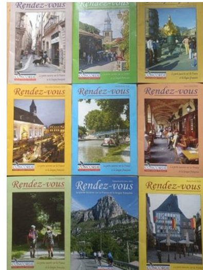
Rendez-vous French learning magazines