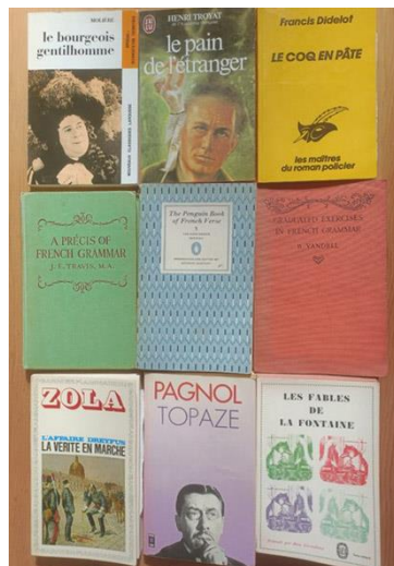
A selection of books In French

French connections. Three French ceramic items: Limoges, a mug from the town of Gien, a Denbac pot of Vierzon. Famous French steam loco type seen in Calais in the days of steam. Small souvenir metal tray from Alençon.